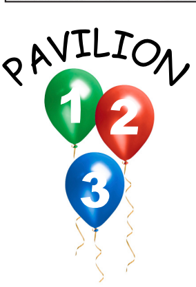
Pre-School Nursery Out of School Clubs